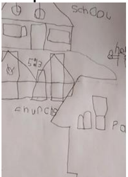
William's map to school.