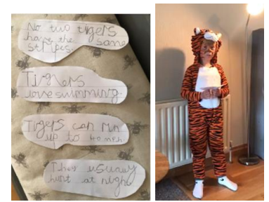
Louis facts about tigers.